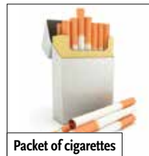
Packet of cigarettes