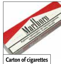
Carton of cigarettes