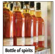
Bottle of spirits