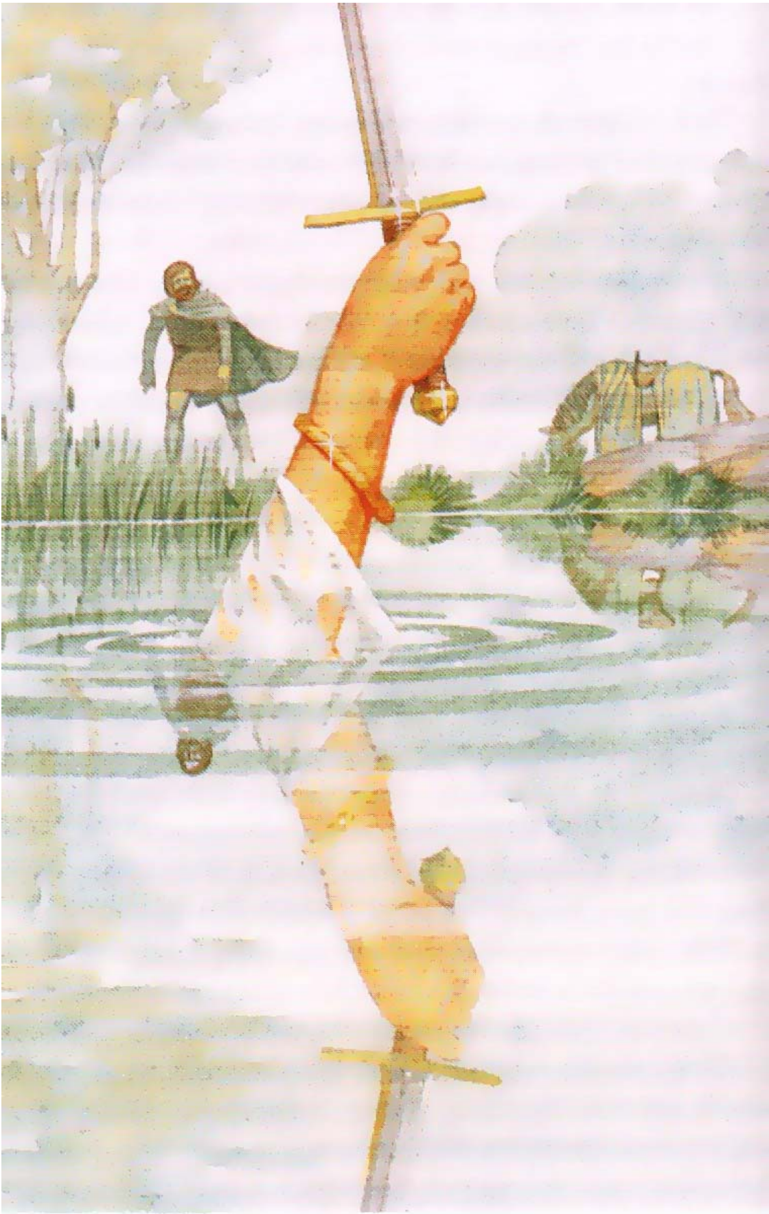
An arm came up out of the water and caught the sword.