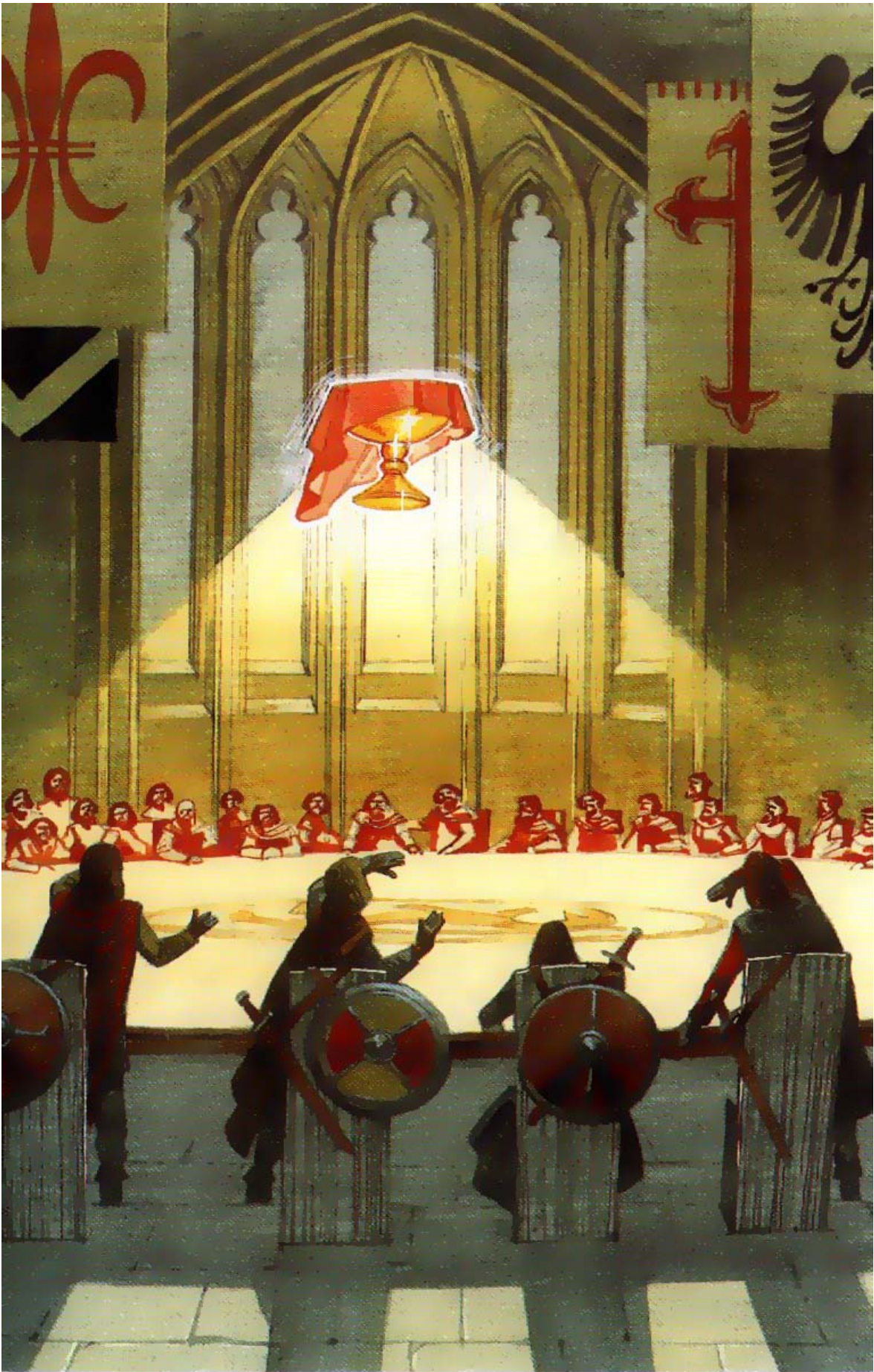
They looked up and saw a gold cup above the table.