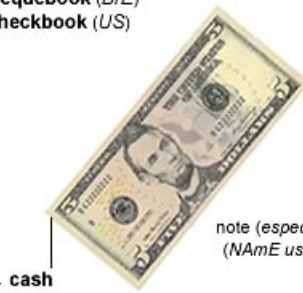
note (especially BrE) (NAme usually bill)