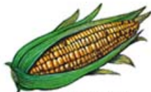
corn on the cob