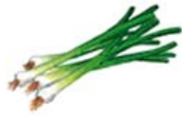
spring onions (BrE) green onions (NAme)